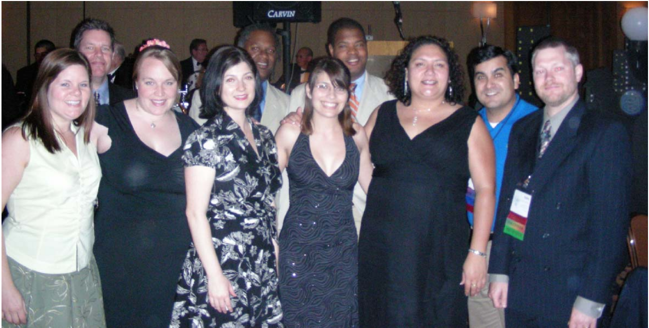
06-07 Execs at the Annual Conference

The 06-07 Executive Committee would like to thank the membership for giving us the opportunity to serve WACUHO in such a rewarding capacity.